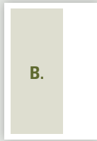
B. 2/3 PAGE VERTICAL 4 1/2" (w) x 10" (h)