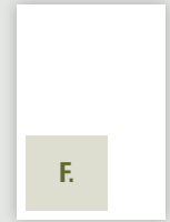
F. 1/3 PAGE SQUARE 4 1/2" (w) x 4 7/8" (h)