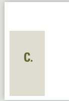
C. 1/2 PAGE ISLAND 4 1/2" (w) x 7 1/2" (h)